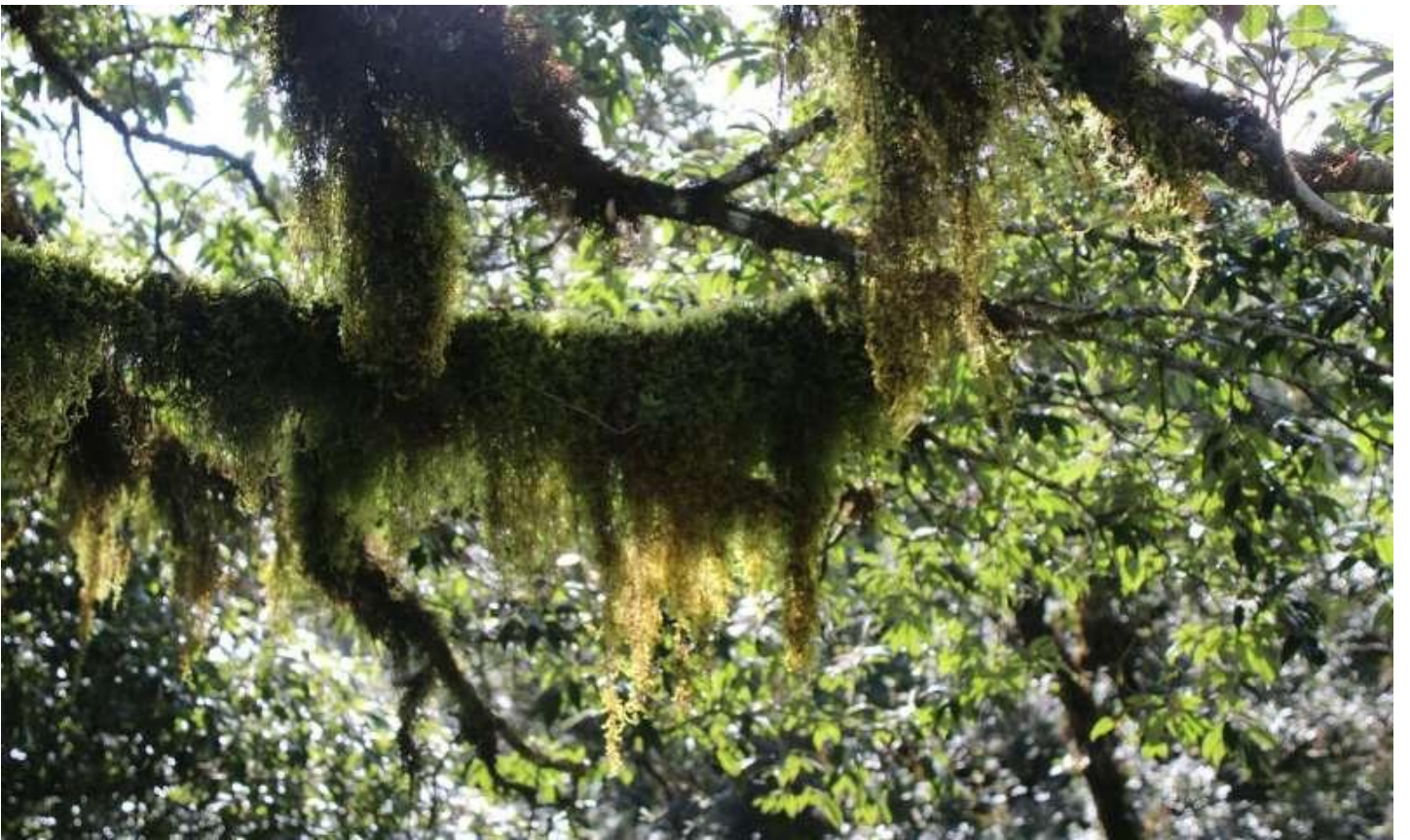
Bryophyte at Ailao Mountain subtropical forest.